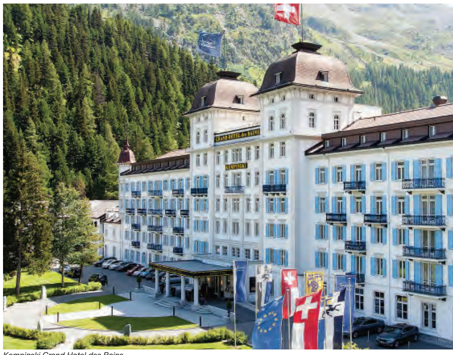
npinski Grand Hotel des Bains

d'Oro,' awarded an impressive 15 Gault Millau points, specialises in innovative variations on traditional Italian dishes. Its combination of traditional sophistication, superior service, contemporary furnishings, and vibrant modern paintings creates an ambience which is both comfortable and stylish. The guestrooms are modern and welcoming, using the warm tones of cherry wood and a soft colour palette to soothe and contrast with the brilliance of the natural landscape outside. For the ultimate indulgent experience there are two opulent suites; located in the towers of the hotel, they are flawlessly appointed in refined colour schemes of golden tones, rich reds, and champagnes befitting royalty. The Kempinski Grand Hotel des Bains offers the discerning quest a luxurious pampering experience in an idyllic location throughout the year.