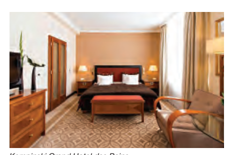
Kempinski Grand Hotel des Bains

d'Oro,' awarded an impressive 15 Gault Millau points, specialises in innovative variations on traditional Italian dishes. Its combination of traditional sophistication, superior service, contemporary furnishings, and vibrant modern paintings creates an ambience which is both comfortable and stylish. The guestrooms are modern and welcoming, using the warm tones of cherry wood and a soft colour palette to soothe and contrast with the brilliance of the natural landscape outside. For the ultimate indulgent experience there are two opulent suites; located in the towers of the hotel, they are flawlessly appointed in refined colour schemes of golden tones, rich reds, and champagnes befitting royalty. The Kempinski Grand Hotel des Bains offers the discerning quest a luxurious pampering experience in an idyllic location throughout the year.