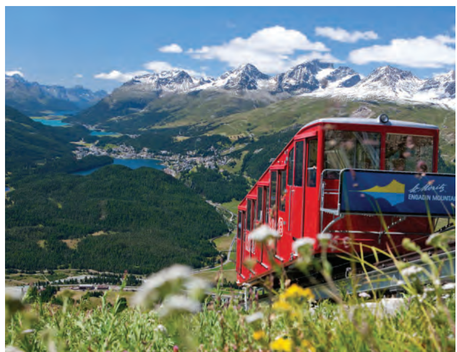
View over St Moritz

We recommend travelling to Switzerland by train from London to St Moritz, via Paris, Zurich, and Chur. Return flights from the UK with rail travel in Switzerland can also be arranged. Your destination is St Moritz, in the shadow of the Suvretta Mountain and on the shores of the startlingly beautiful Lake St Moritz. Use your time here to explore the surrounding mountain peaks on foot or by funicular, rack railway, or cable car, taking in the views across the Engadine Valleys, the castles perched on high rocks, and the small villages almost completely hidden by forested mountain slopes. St Moritz itself has always been a particularly popular Swiss winter destination, but its value extends into the summer months, as the snow thaws to reveal a network of hiking trails and transforms the town itself into a chic collection of boutique shops and cafes, and gourmet restaurants. One of the highlights of your stay here will be the fantastic rail journeys that sit just on your doorstep, be it the local services that meander through the valleys or the grand Bernina Express, one of the most iconic rail journeys in Europe.