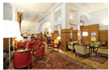
Hotel Schweizerhof St Moritz lobby