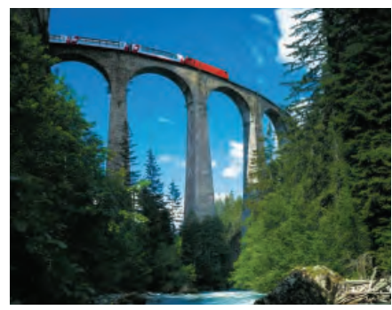
By Rail to the Engadine Holiday