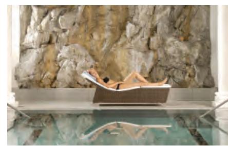
Kempinski Grand Hotel des Bains spa