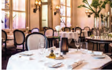
Kempinski Grand Hotel des Bains dining