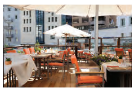
Hotel Schweizerhof St Moritz terrace