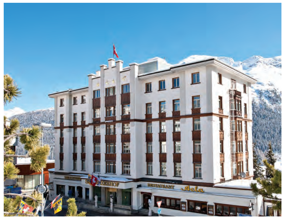
Hotel Schweizerhof St Moritz