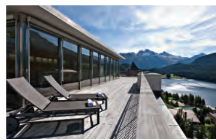
Hotel Schweizerhof St Moritz spa terrace